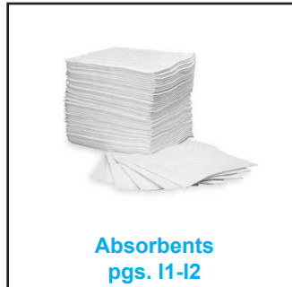
Absorbents pgs. I1-I2