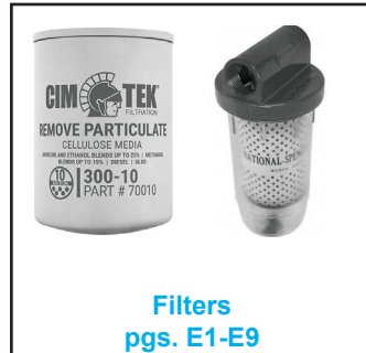
Filters pgs. E1-E9