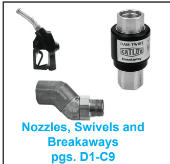
Nozzles, Swivels and Breakaways pgs. D1-C9

Strick Equipment Sales offers special quantity pricing and freight allowances on many of its products such as pumps, filters, nozzles, tank hardware and more. Call for details!