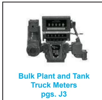
Bulk Plant and Tank Truck Meters pgs. J3