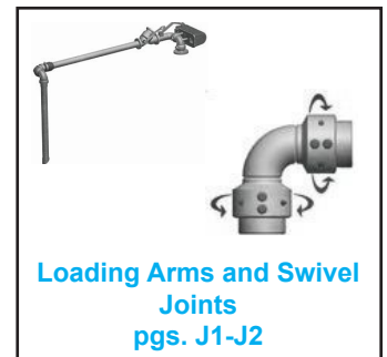
Loading Arms and Swivel Joints pgs. J1-J2