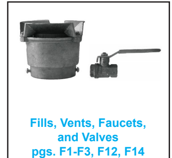
Fills, Vents, Faucets, and Valves pgs. F1-F3, F12, F14