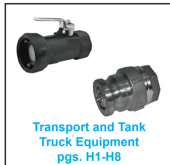
Transport and Tank Truck Equipment pgs. H1-H8