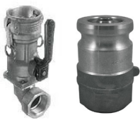
Dry Disconnects pgs. H2-H3