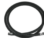
Station Hose pgs. D8