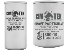
Fuel Filters pgs. E1-E9