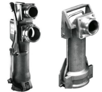
Transport Equip. pgs. H6-H7