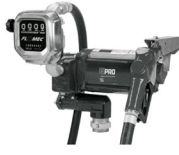
GPI Pumps pgs. B1-A12