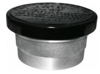
Emergency Vents pgs. F3