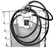
DEF Equipment pgs. C1-C6