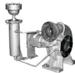
Gorman-Rupp Pumps pgs. J4-J5