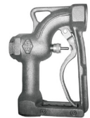
Tank Truck Nozzles pgs. H1

visit our website @ www.strickequipment.com