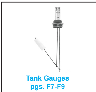
Tank Gauges pgs. F7-F9