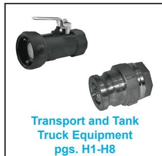
Transport and Tank Truck Equipment pgs. H1-H8