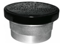
Emergency Vents pgs. F3