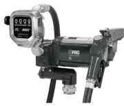
GPI Pumps pgs. B1-A12