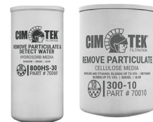
Fuel Filters pgs. E1-E9